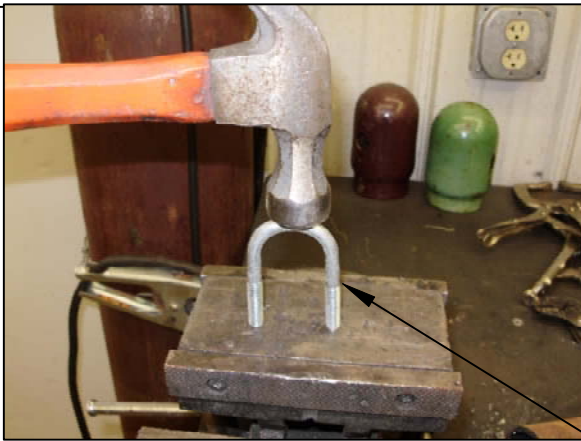
FRONT VIEW OF THE # BG-33

WHEN PLACING THE TOP PLATE ONTO THE BUMPER THIS WILL BE A TIGHT FIT. SLIDE ONE SIDE DOWN ONTO THE BRACKET AND THEN PULL THE OPPOSITE BRACKET INWARD WITH ONE HAND TOWARD THE OTHER BRACKET AND PUSH DOWN ON THE PLATE WITH OTHER HAND.