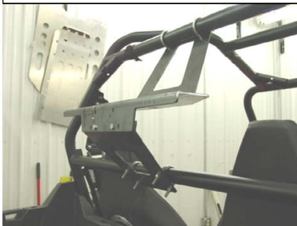
BRACKET MOUNTED TO THE ROLL CAGE.